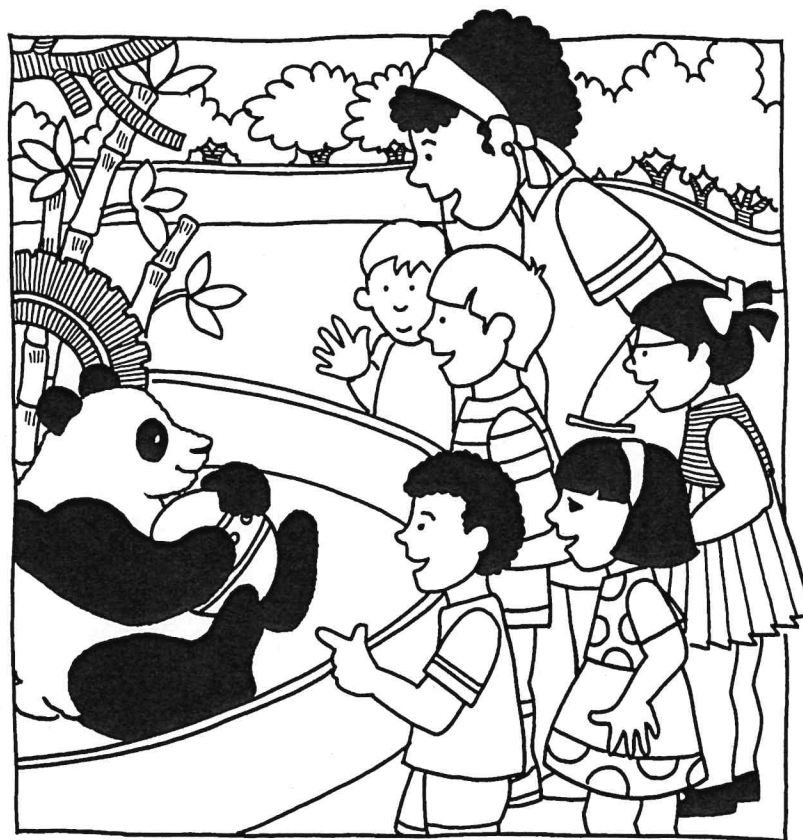
These school kids came to the zoo. They are looking at Yin-Yin.